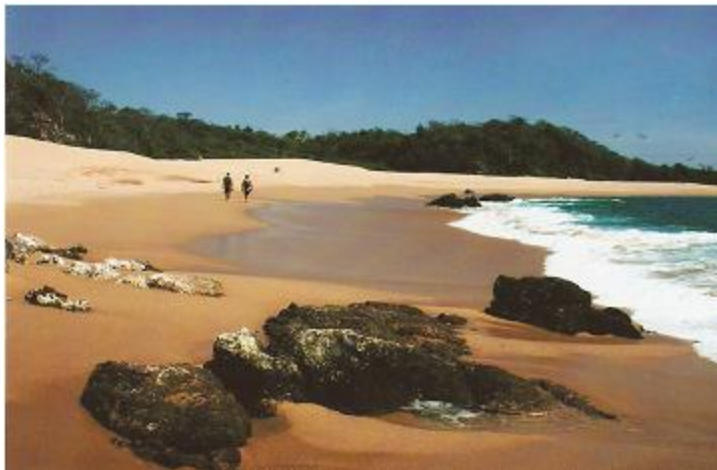
Secluded Huatulco Beach Mexico