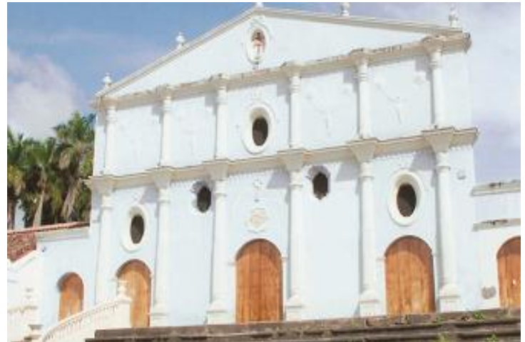
Town Square Nicaragua