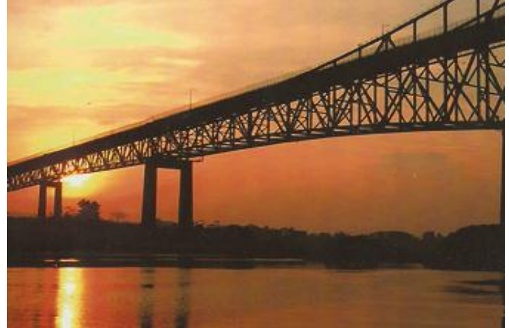
Millennium Bridge Panama