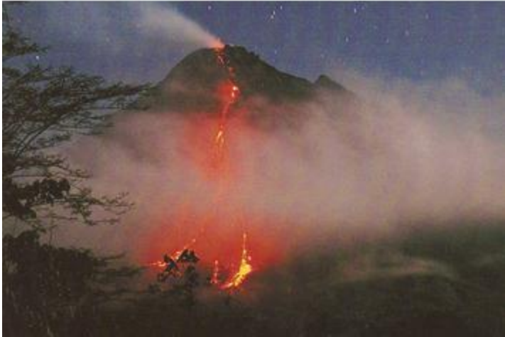
Arenal Volcano Eruption Costa Rica