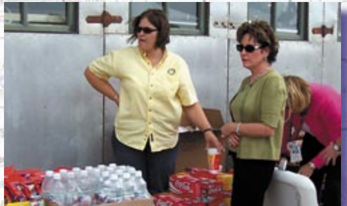
Greater Big Spring Webb Air Base Reunion Day