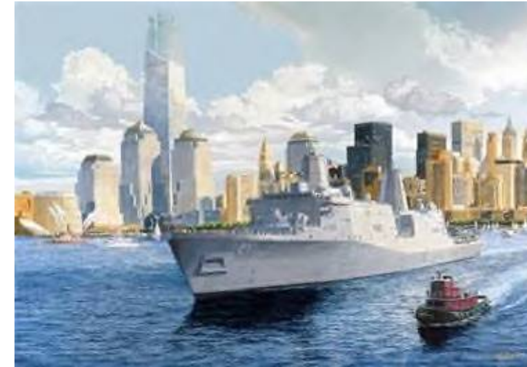
Artist's Rendering of the USS New York)

With a year to go before it even touches the water, the Navy's amphibious assault ship USS New York has already made history. It was built with 24 tons of scrap steel from the World Trade Center.