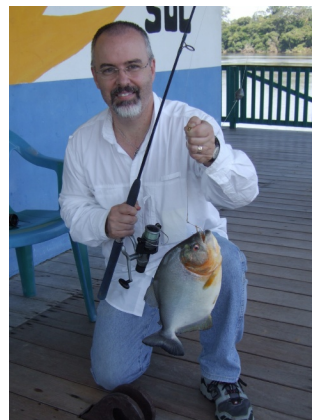
The mighty pirahna!